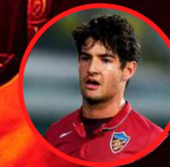
ALEXANDRE PATO TIANJIN QUANJIAN