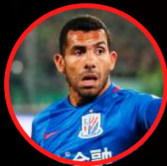
CARLOSTEVEZ SHANGHAI SHENHUA