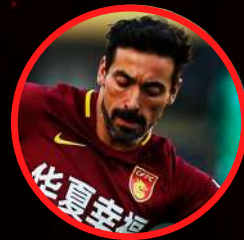
EZEQUIEL LAVEZZI HEBEI CHINA FORTUNE