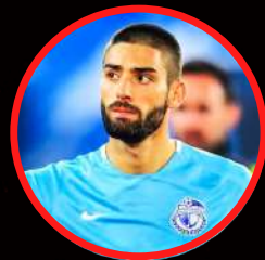
YANNICK CARRASCO DALIAN PROFESSIONAL