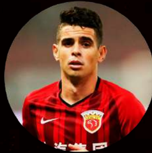
OSCAR SHANGHAI SIPG