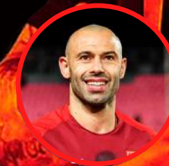
JAVIER MASCHERANO HEBEI CHINA FORTUNE