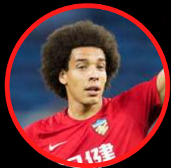
AXEL WITSEL TIANJIN QUANJIAN