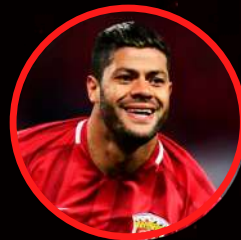
HULK SHANGHAI SIPG